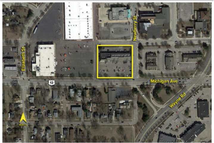
Aerial_Wayne_35300-35354 Michigan Ave