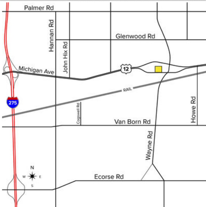
Map_Wayne_35300-35354 Michigan Avenue